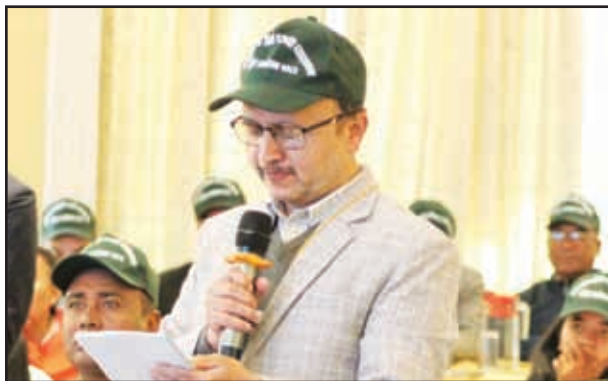
Question from participant during floor discussion