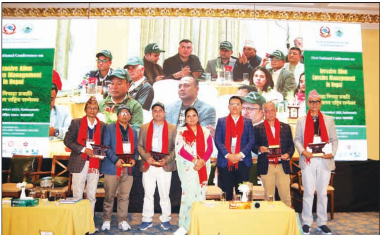
Group photo of presenters with session chair and moderator at the end of the session