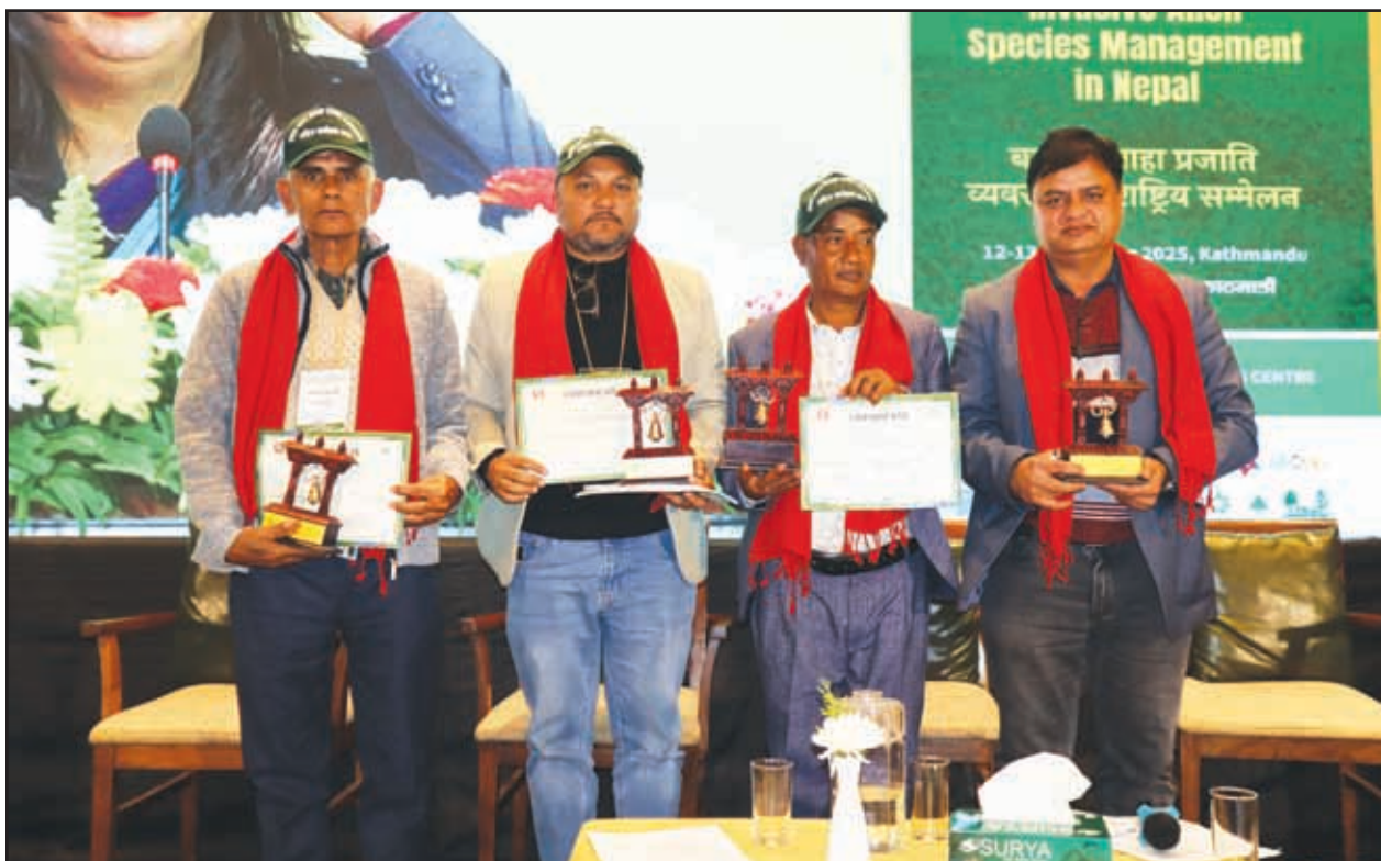
Group photo of presenters with session chair at the end of the session.