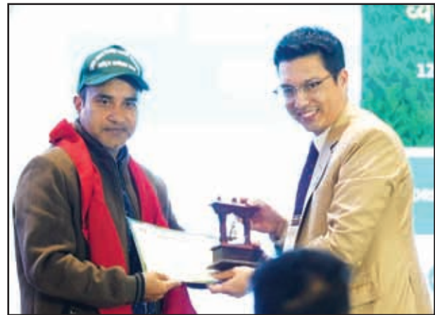
Session chair presenting certificate and token of love to the presenter