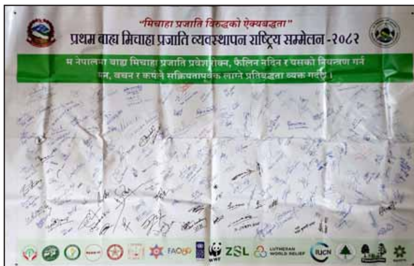
Commitment signed by the participants to actively work towards prevention and control of IAS in Nepal

To formally express the participants' commitment to managing invasive alien species, a flex print was prepared with the statement: "I pledge to actively prevent the introduction and spread of invasive alien species in Nepal and to engage in their management and control through my mind, words, and actions." Throughout the event, around 300 participants including the Chief guest and other distinguished guests signed the flex print to demonstrate their solidarity and collective responsibility in preventing and controlling invasive alien species. This act reflects the strong dedication of all participants to supporting conservation and management efforts in the country.