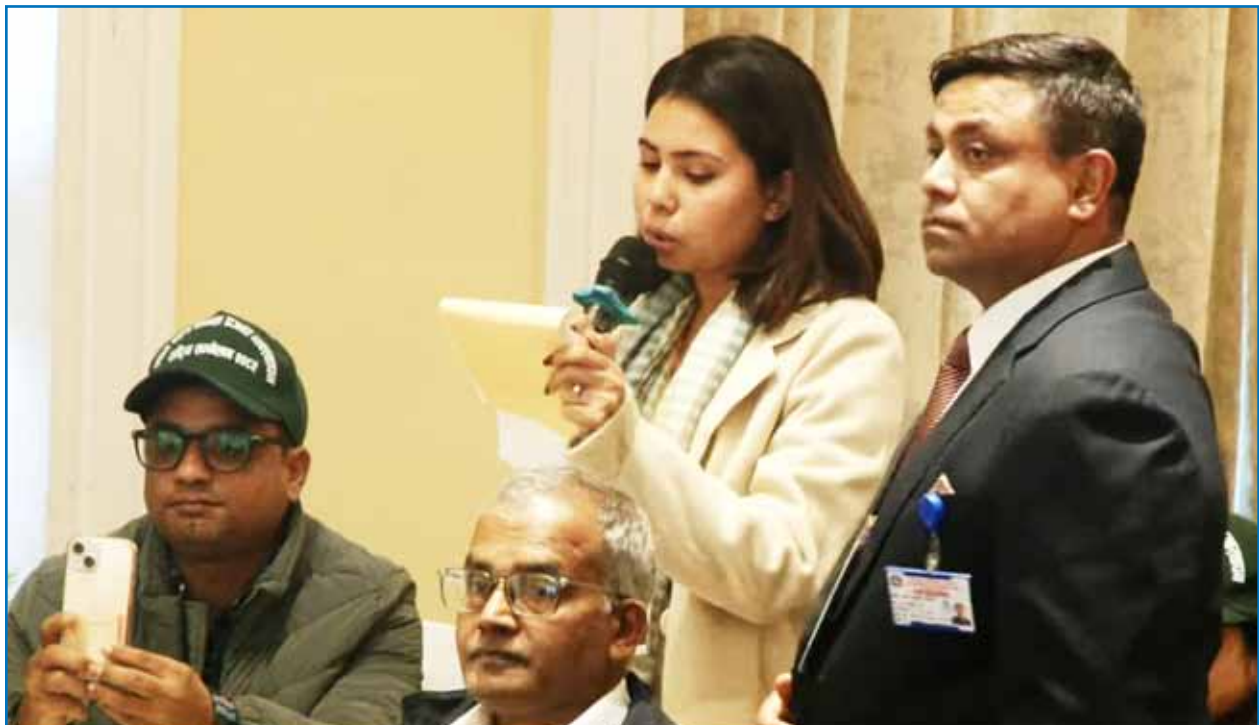
Participant's engagement during interactive discussion session