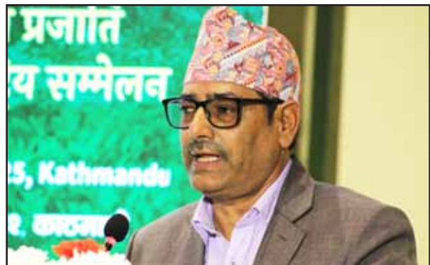
Chief guest, Honorable Madhav Prasad Chaulagain, Minister for Ministry of Forests and Environment, delivering closing remarks