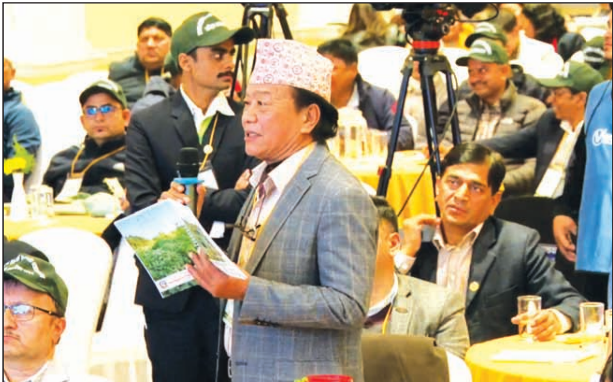
Participant's engagement during interactive discussion session