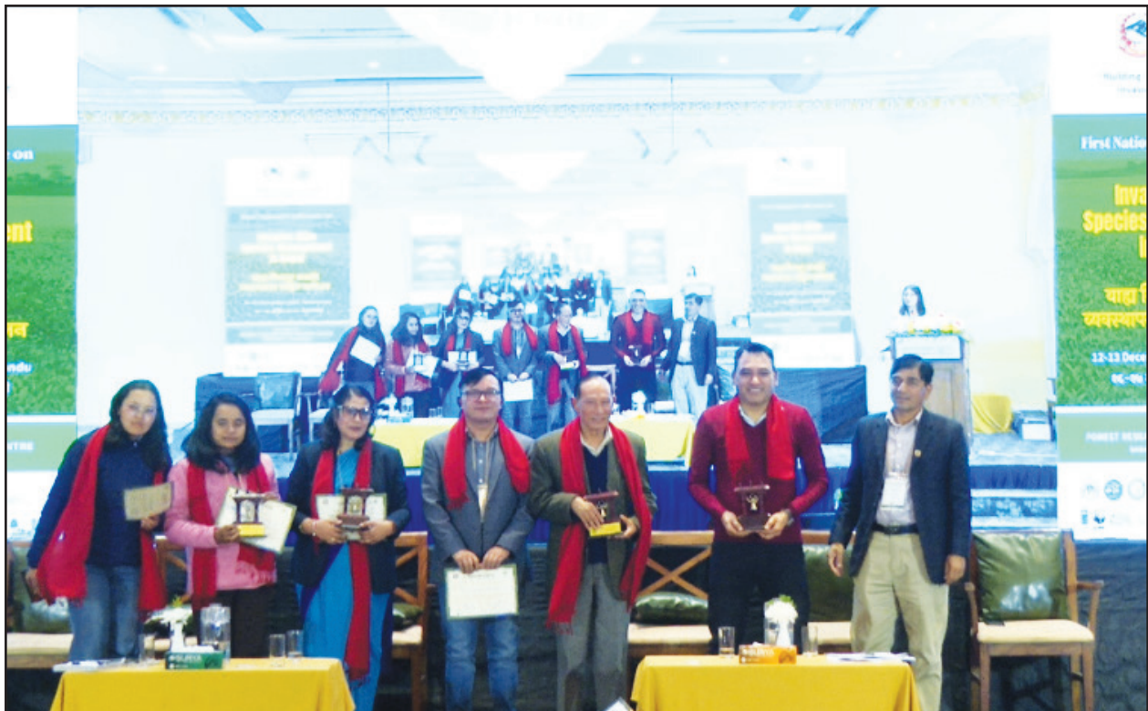
Group photo of presenters with session chair and moderator at the end of the session