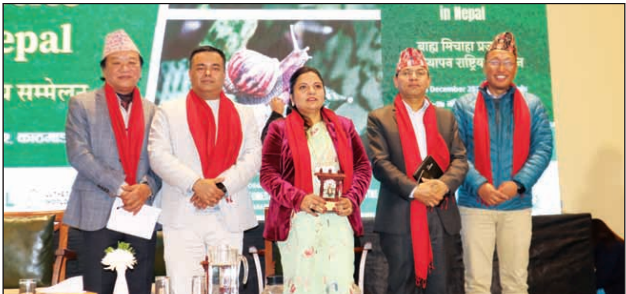
Group photo of panelists with moderator at end of the session