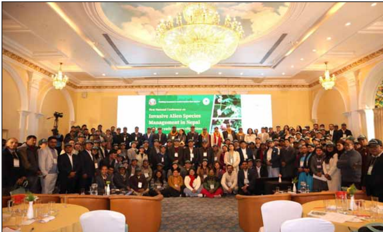
Group photo of participants with distinguished guests at the end of the opening session of the program