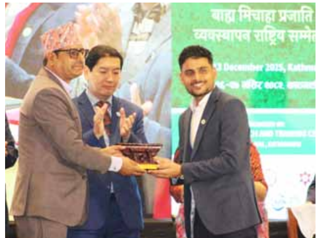
Honorable Minister Madhav Prasad Chaulagain presenting token of love to the members of conference secretariat