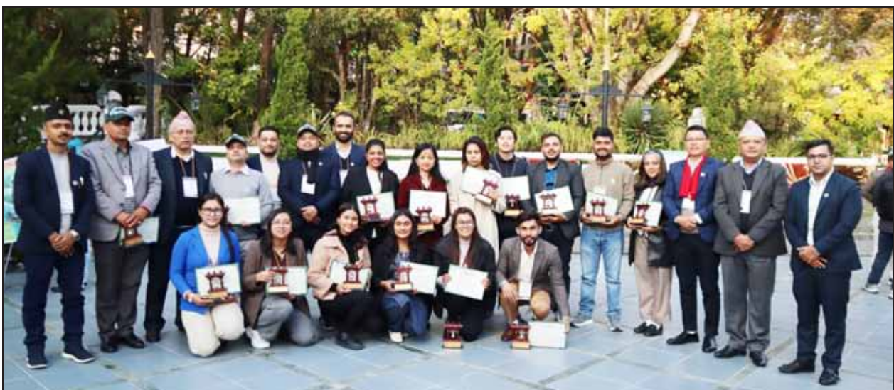
Group photo of poster presenters with certificate and token of love