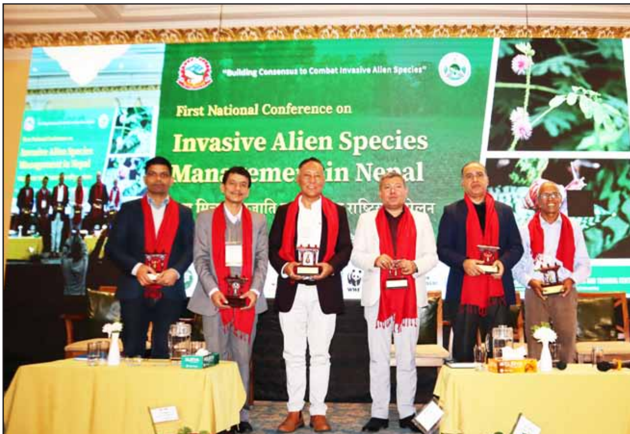
Group photo of panelists with moderator at the end of the panel discussion