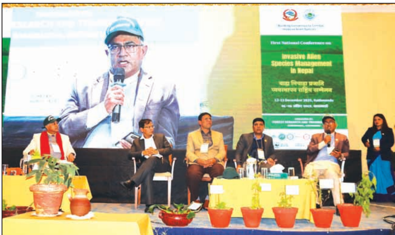
Presenters and session chair during question and answer session.